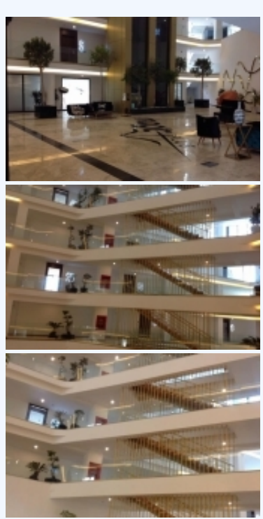
Luxurious\ 3\ and\ 2\ Bedroom\ Apartment\ For\ Rent\ Location\ Girne\ 2+1\ Apartment:\ 650\ gbp\ 3+1\ Apartment:\ 750\ gbp\ Maintenance\ fee\ (Aydet):\ 85\ gdp